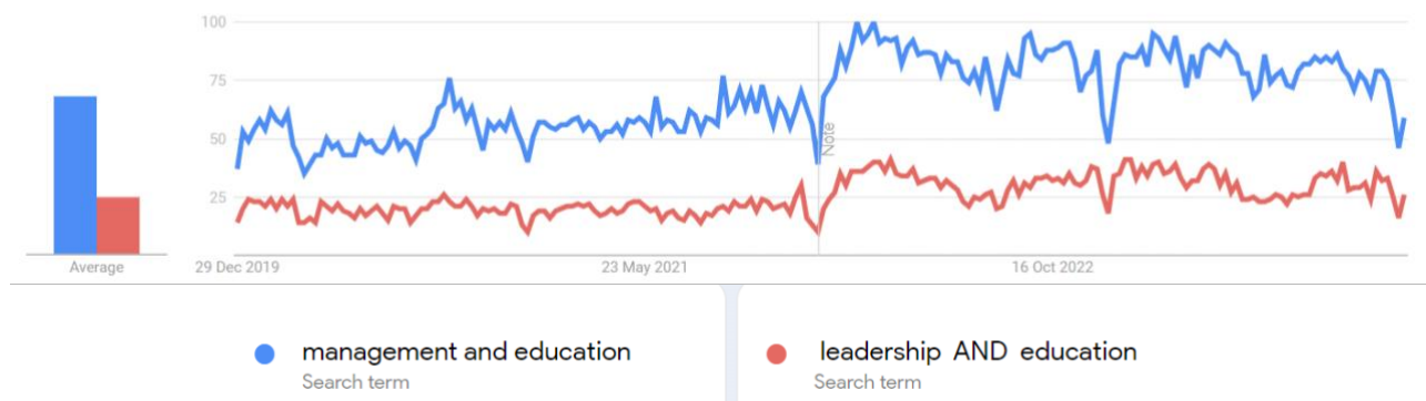
Figure 1. Trend Analyses of Effective Management Styles in Educational Institutions: Dynamic Analysis of Google Queries from 2000-2023 Source: created by authors using Google Trends

Conducting a trend analysis also reveals a fairly stable trend among Internet users' search queries regarding educational management styles and their effectiveness (figure 1). This stability indicates a sustained interest in understanding how different management approaches impact educational environments. Over the years, educators, researchers, and policymakers have consistently sought information on best practices in educational leadership and management.