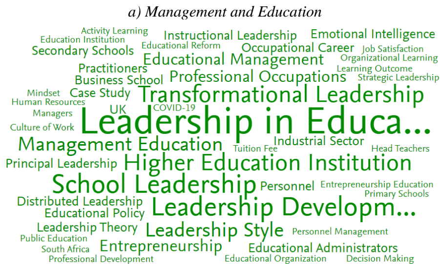
Figure 3. Keyphrases word cloud on Effective Management Styles in Educational Institutions: Analysis of SciVal Publications from 2018-2023 Source: created by authors using SciVal

In conclusion, the thematic areas of research on effective management styles in educational institutions are diverse and comprehensive. They encompass various leadership styles, institutional contexts, professional development, management theories, educational outcomes, policy influences, contextual challenges, and innovation. This diversity reflects the complexity of educational